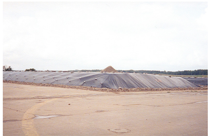
Construction Site Covers