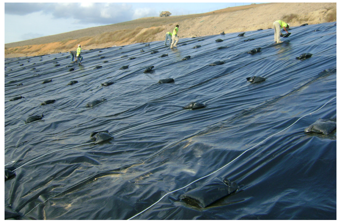
Temporary Rain Shed Cover