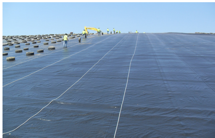
Temporary Rain Shed Cover