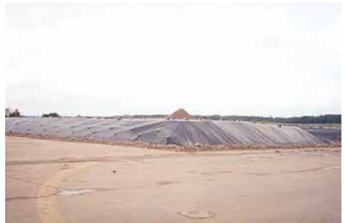
Construction Site Covers