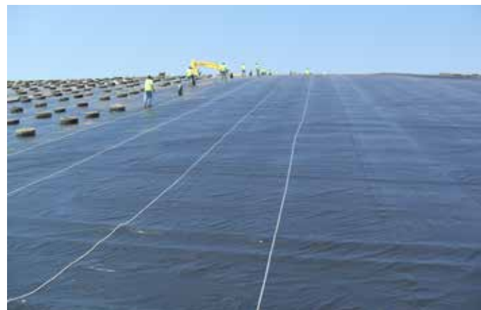
Temporary Rain Shed Cover